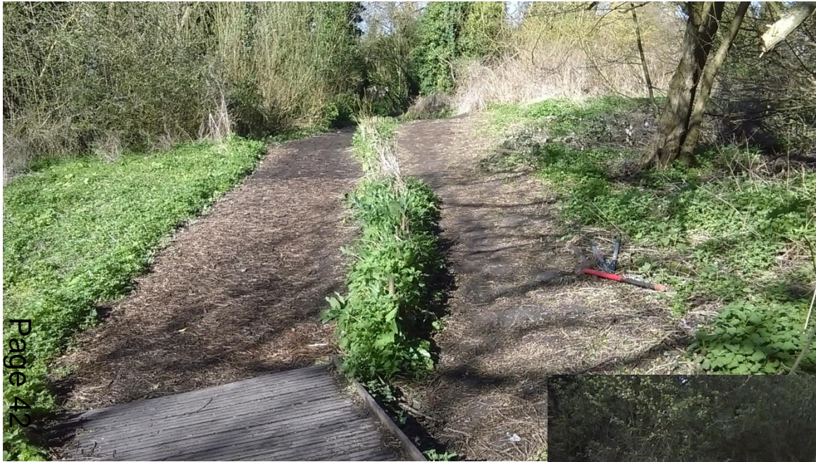
Photograph of the works completed at Paradise Nature Reserve before and after